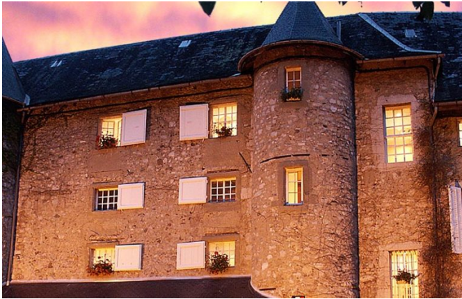
Chateau des Comte de Challes