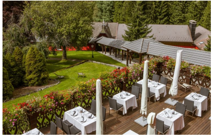
Hotel Les Jardins de Sophie