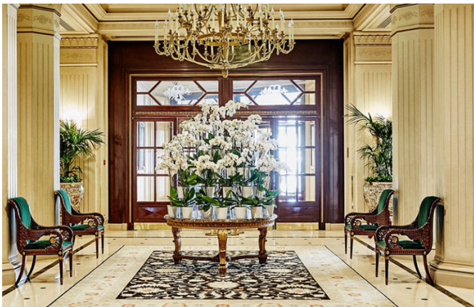
Hotel Intercontinental Le Grand, Paris